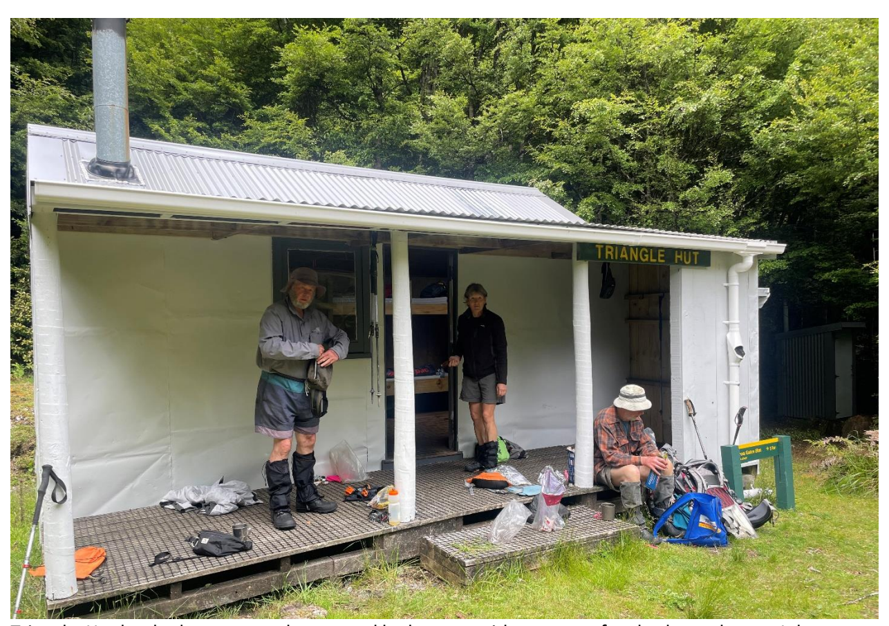
Triangle Hut has had a recent makeover and looks great with a new roof and colour scheme. It has a new long drop too. Thanks to BCT and all those who helped with that job.

Back to the hut for lunch then an excursion down river to service more traps. A single male whio got a surprise to see us and flew away downstream. We went back to Triangle for a 2nd night - lovely.