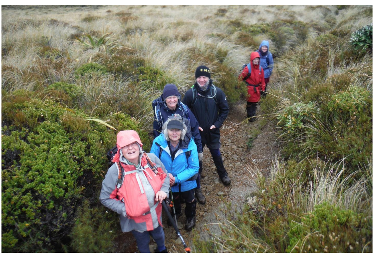
Botanising for alpine flowers up past Rangiwahia Hut, Ruahine Forest Park.