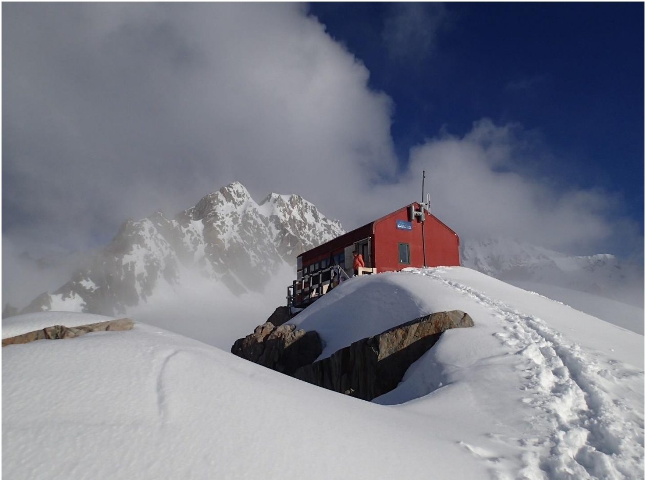
PNTMC Photo Competition 2024