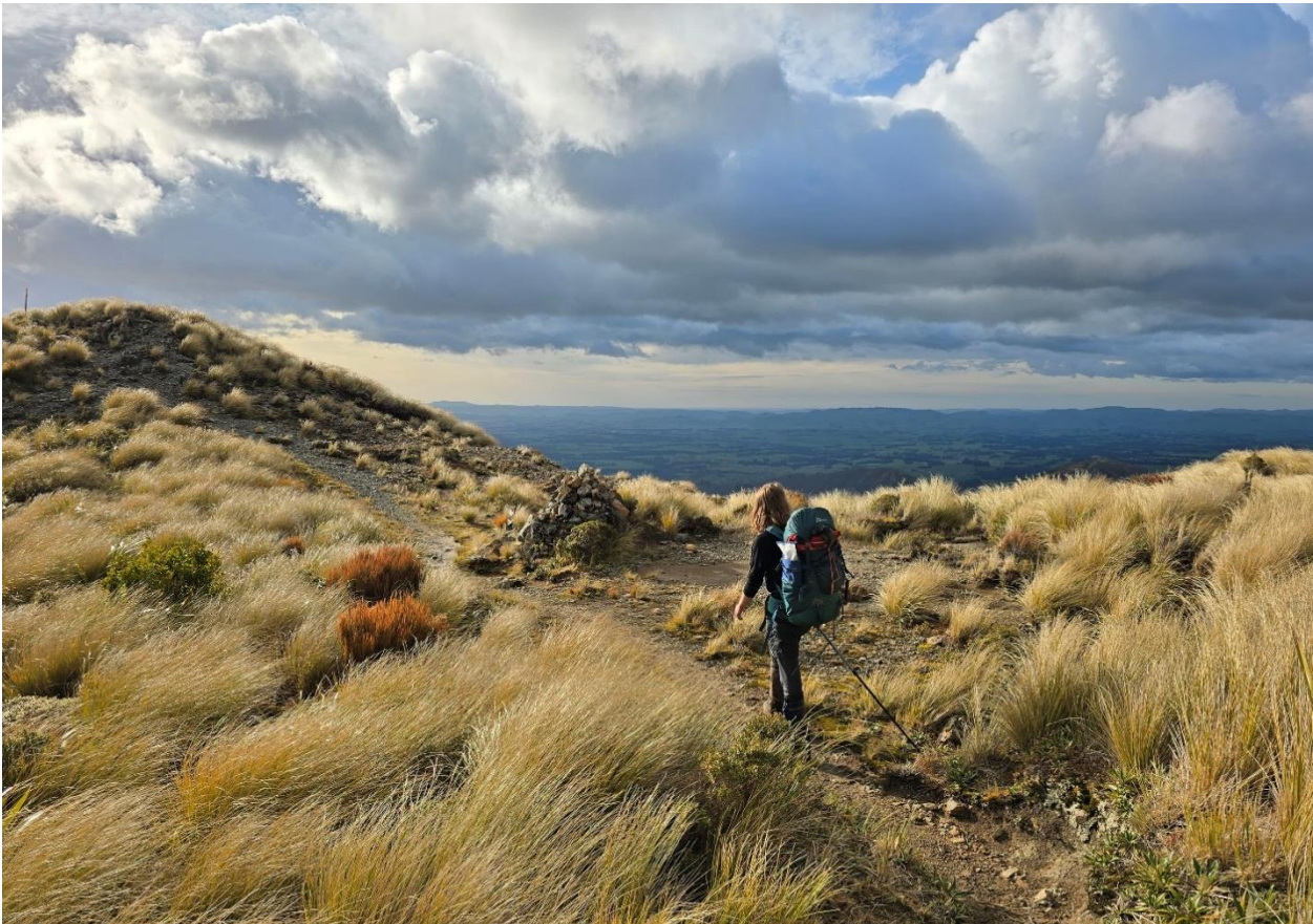
Heading back down from Longview.