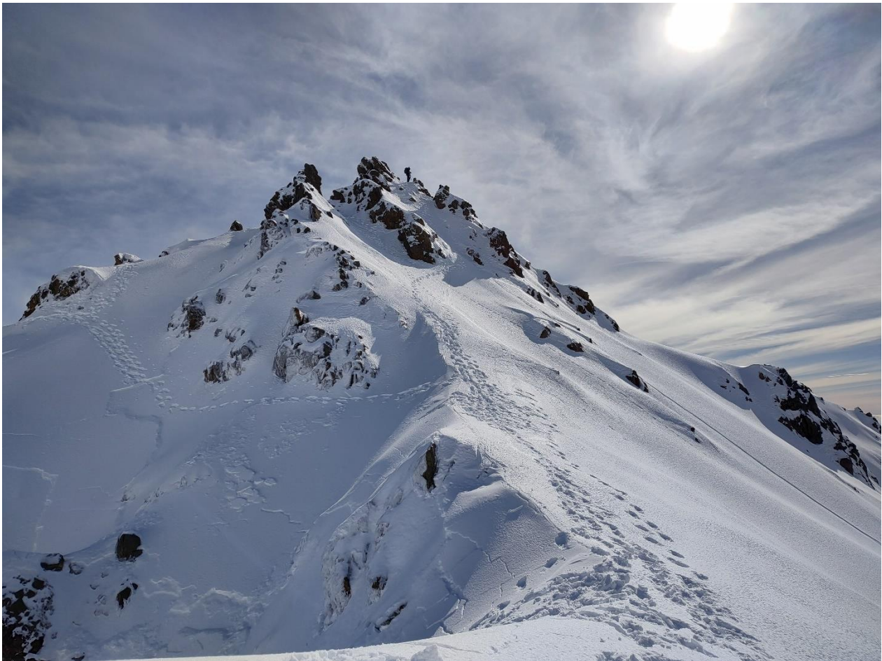
Spot me on top of the Pinnacles