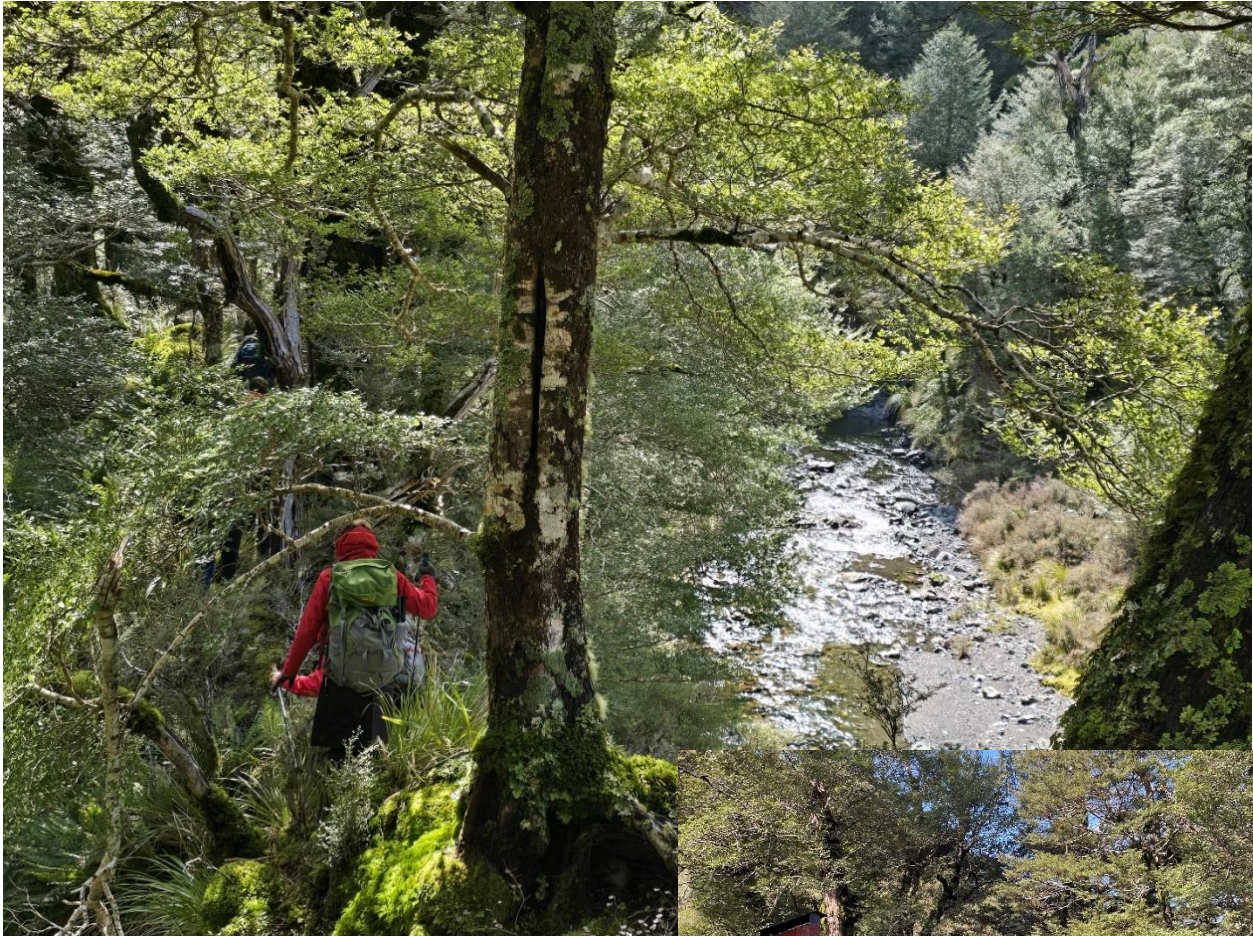
Dropping down to the Pohangina River to visit Top Gorge Hut.

After a windy night we left Longview at 7.00am to head down to the car park and stopped by a cafe in Norsewood on the way back to Palmy.