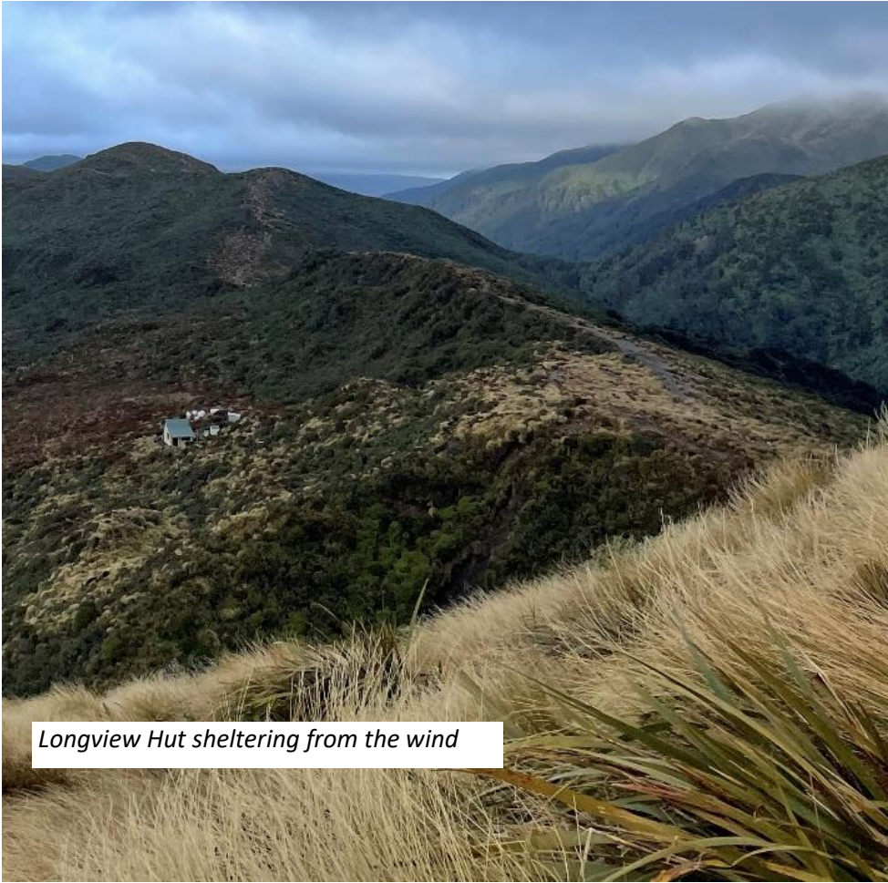
Longview Hut sheltering from the wind