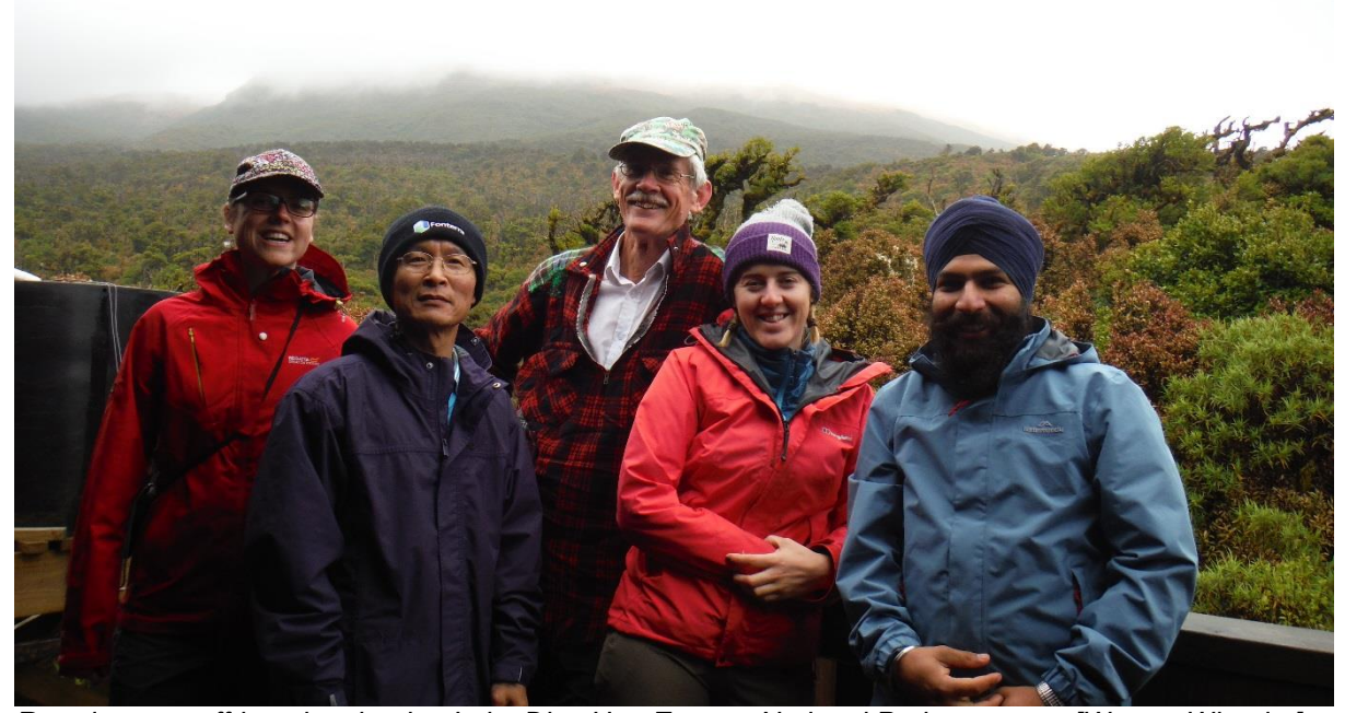
Rready to set off into the clouds - Lake Dive Hut, Egmont National Park.