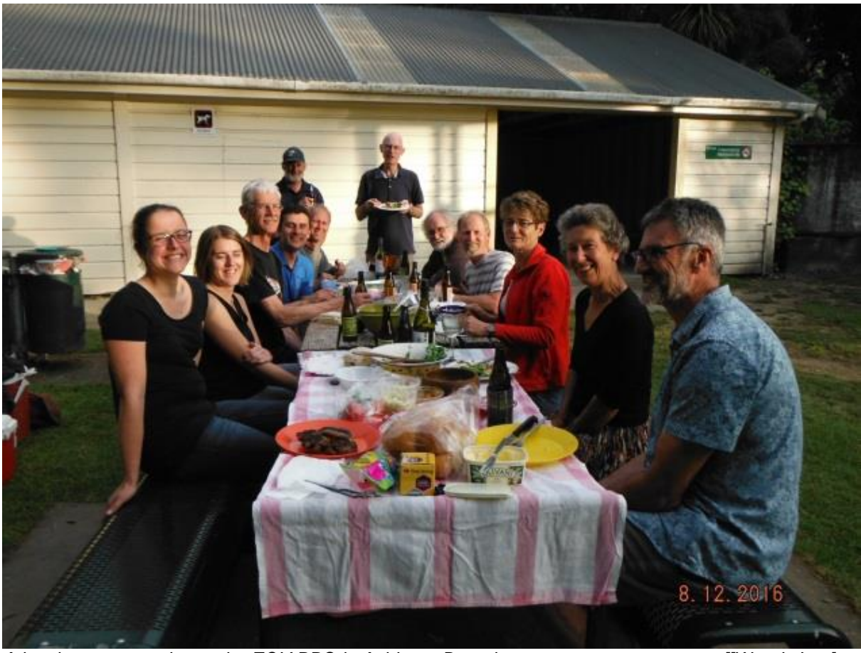
A lovely warm evening at the EOY BBQ in Ashhurst Domain