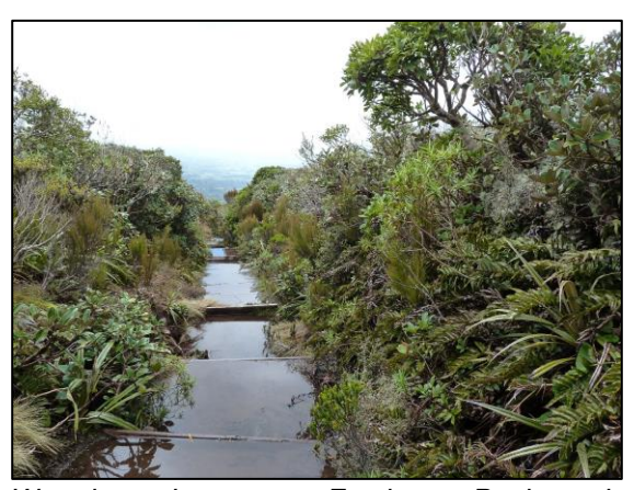
Waterlogged steps on Fanthams Peak track

The track crosses the slopes of Fanthams Peak and passes some interesting volcanic geology before descending on the staircases on the Fanthams Peak Track. We had a few glorious moments of sunshine amongst the cloud and generally it stayed dry. The track led us back into the still very wet bush and with wet feet we arrived back to the visitor centre at around lunchtime. We did a quick loop of the Wilkies Pools Track which offers wonderful views of the cascade and some opportunities for tasting fresh springwater.