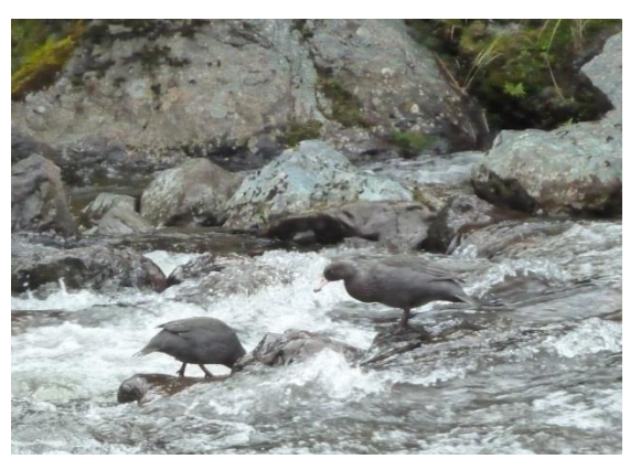
Whio pair feeding in Pohangina River.

Almost back at the hut we were delighted seeing the happy whio couple together. They gracefully swam downstream, catching insects along the way, sitting on rock, or just gently floating. It was cool to see them do what river ducks do. They show awesome river skills, blend in very nicely with the environment, and clearly belong at the river. After a while the male duck lost his beloved female and whistled dramatically in wait for a reply. She totally ignored him. He frantically looked and called out for her and swam a long way down river until he gave up and flew away. That is the last we saw of the (not so) happy couple.