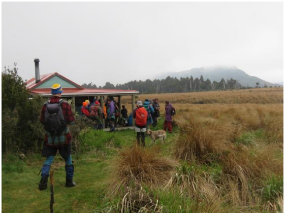
The mob regroups at Ruahine Corner Hut.

We were driven by 4WD vehicles across part of Mangaohane Station then started walking across the magnificent Mangaohane Plateau to Ruahine Corner Hut. Unfortunately the weather was clagged in with minimal visibility and light drizzle. The walk was very well organised in that there were lots of guides in their high viz vests. It took 3 hours to walk to the hut, and by the time we got there the weather had cleared a little and we had some views across the tussock. I enjoyed talking to all sorts of people as I walked.