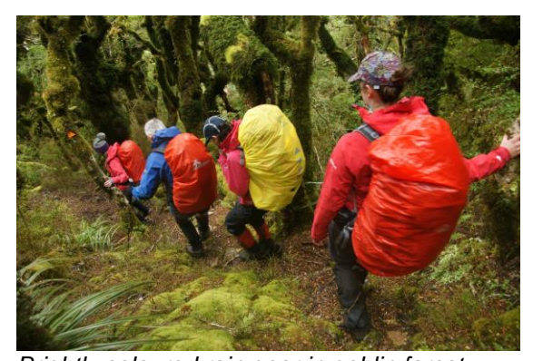
Brightly coloured rain gear in goblin forest.

Pressing on we stopped briefly at a break in the trees to admire a view of the ranges across the valley. That hadn't been there before! At the sign pointing down to the Waingawa R. we chose to carry on along the unmaintained track to Cow Saddle, following a faint footpad and the occasional scrap of pink tape with only a misturn or two down to the saddle and the track in from the Ruamahanga.