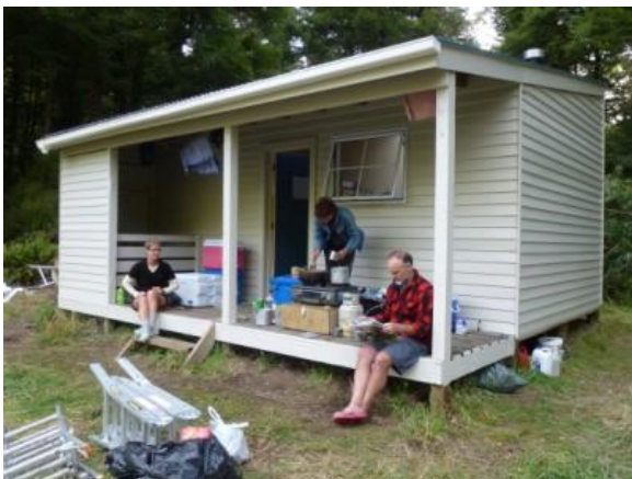
Colenso Hut before and after

We left Nathan at the hut and went for a walk downstream to spot whio and find some house sized boulders. The hut is on the bank looking over a wide river flat but downstream it narrows until you reach a tricky log jam including a waterfall, once through that you either turn right to head up the Mangatera river to Potae or hang a left to find the boulders. We wandered down for a while and eventually came across some very large rocks (not sure if they were the ones we were told about) but unless we wanted a