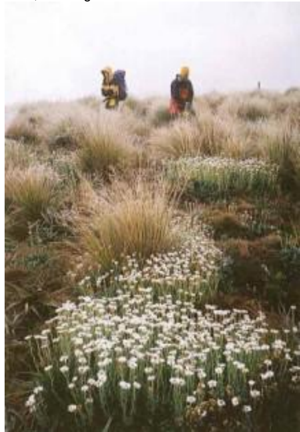
Janet and Nicola on the Hikurangi Range tops.

the track, but it was too claggy for good photos of it. And flowers, flowers everywhere - orange ones, and large white daisies.