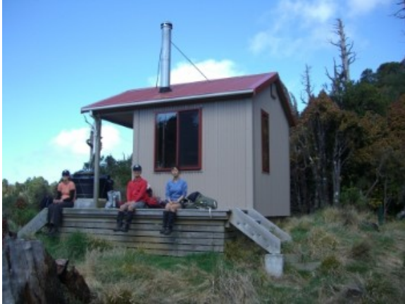
PNTMC at Zekes Hut, Hihitahi Forest Sanctuary

the side to the bottom of the gully. The hut is on a nice sunny NE facing clearing, a little above the stream. And it is a very nice new four-bunk double glazed and insulated model with wood stove and water tank. Over the winter, it sees a couple of parties a month. Despite it not being DOC's highest use / priority track, it was in very good condition, well marked and given the recent raging winds and heavy snow, had very few tree falls.