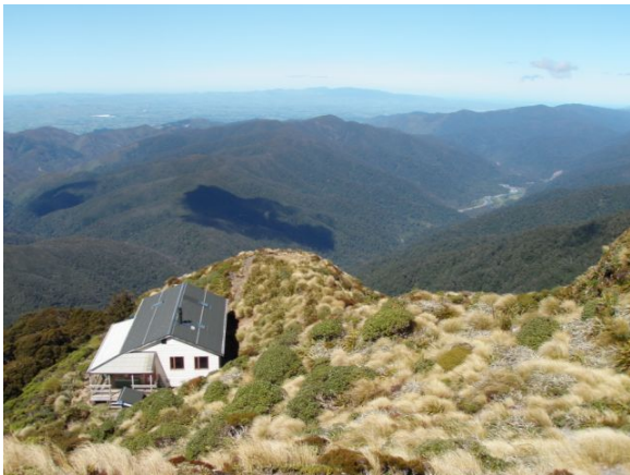
Powell Hut, with the Waiohine Valley, Totara Flats, and Pig Flat beyond.

snow not yet having arrived. By the amount of cars in the car park it was fair to say that we would not be alone in the hills today.