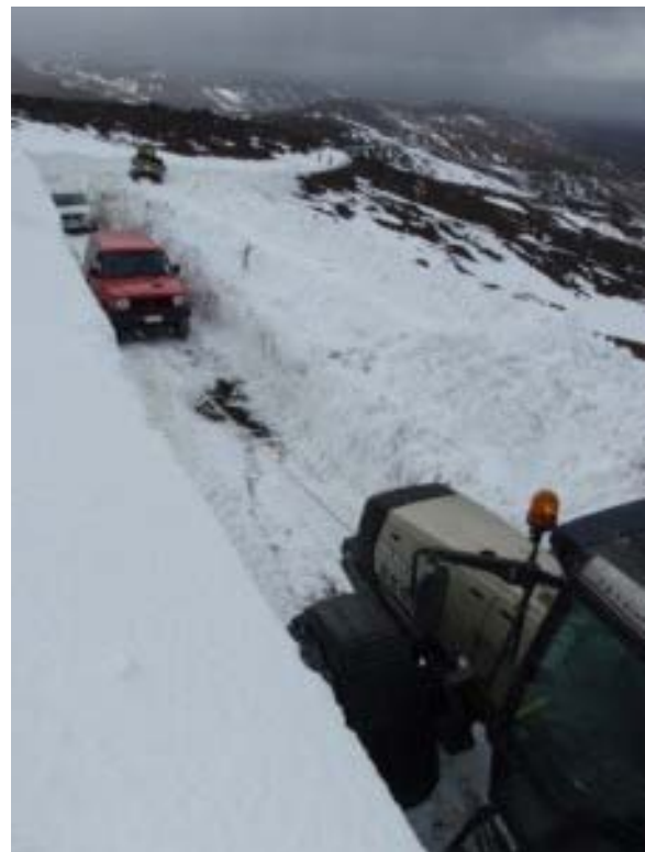
Terry's red Limousine (plus other 4WD) being towed by a mega tractor. Note snow trench depth.

After weeks of terrible weather (actually before the bad weather ended) three brave souls adventured up to Tukino. Mega snow and mega