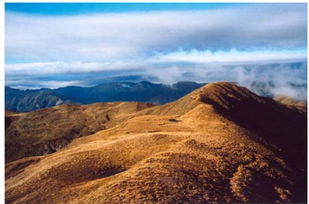
Te Atua Mahuru, at the top of Colenso Spur. Hikurangi range distant. [Jonathon Astin]

The next day saw me up at daybreak to avoid the front predicted to come through that afternoon. As I climbed up from the bivvy, the full force of the wind took me by surprise. Luckily, it was fairly consistent, so by developing a lean I could make tolerable progress. Visibility was very poor, but after I found the right ridge off Tupari, the navigation was straightforward. As I passed Te Atua Mahuru the cloud cleared for a moment and I was rewarded with stunning views. After a stop at Sparrowhawk biv for lunch I continued along the tops to Sunrise hut.