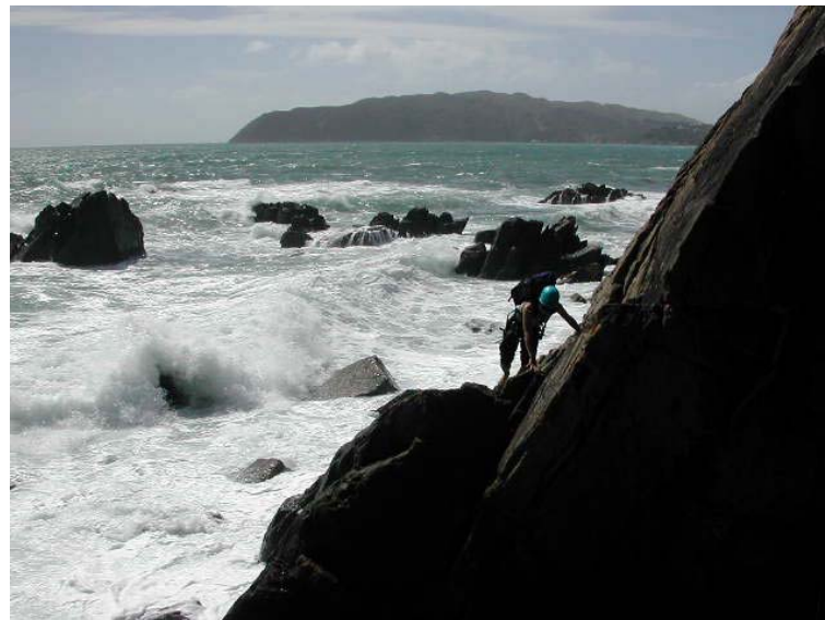
Action and scenery on the rocks at Titahi Bay You should be able to recognise some of these characters. [Grahan Heap]